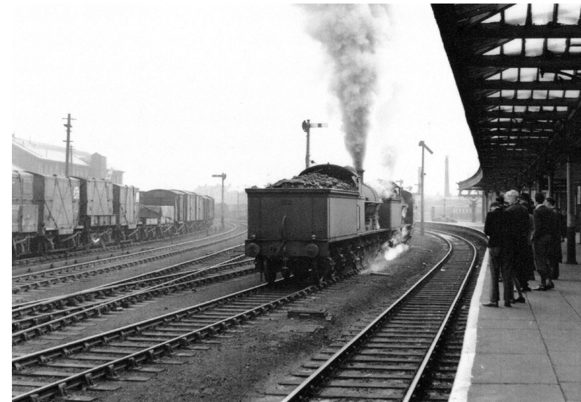
Steam locomotive waiting for a signal at Edge Hill