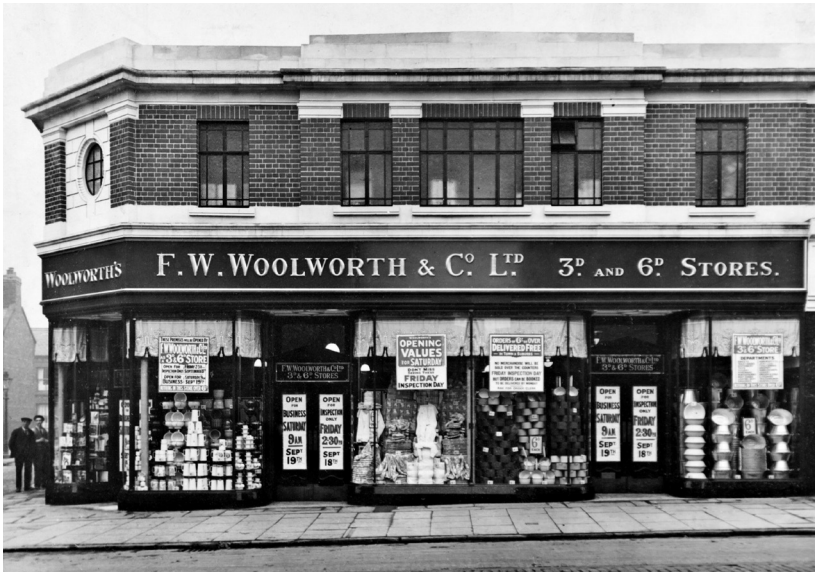
F.W. Woolworth and Co. Ltd

the chap who had just come out of the army, he was a Regimental Sergeant Major, say no more! [32]