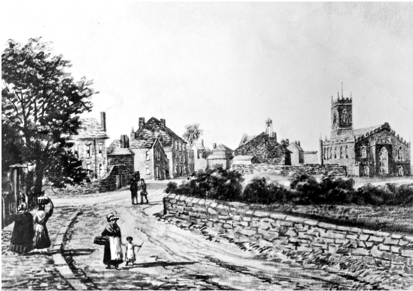
Wavertree Road and St. Mary's Edge Hill, 1829