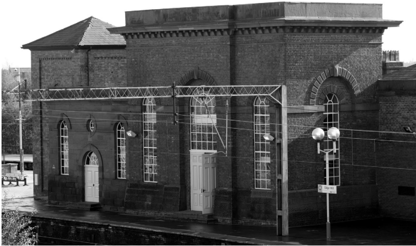
Metal at Edge Hill, 2011