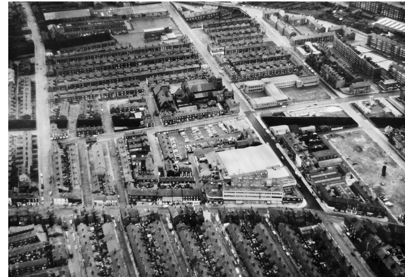
Aerial view of Freeman's and surrounding property, 1966

they built them... and then they brought clubs out and people went to them. So people did start to get together as a community and I think it will happen the same in Edge Hill again... but is it going to be the same anymore? It's one of them... [34]