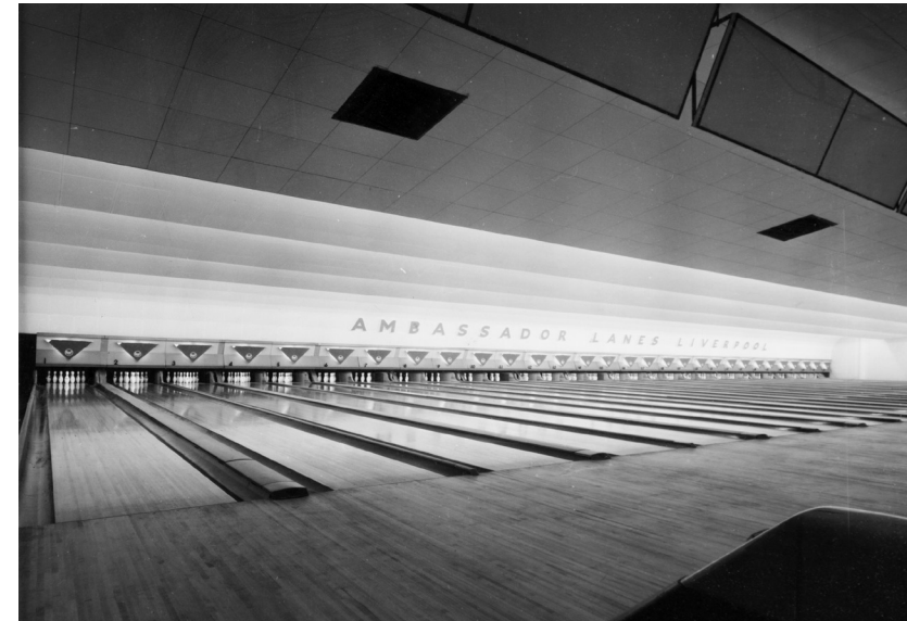
Ambassador Lanes' Bowling Alley, 1960s