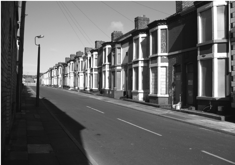
Edge Hill terraces earmarked for demolition, 2009 Kenn Taylor

BY THE TURN OF THE MILLENNIUM, the decline in Edge Hill's population meant the area was subject to the then government's Housing Market Renewal Initiative Pathfinder programme (HMRI). [38] This plan intended to regenerate areas where housing demand was seen to have failed and advocated the wholesale demolition and reconstruction of many deprived areas of the UK. [39]